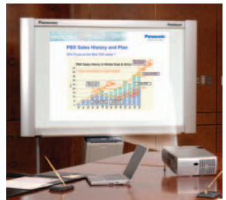
1 Screen can also be used for the Projector. (UB-7325)