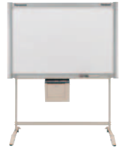
UB-5325 2-Screen Standard size