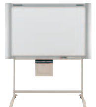
UB-7325 4-Screen Standard size (Stand option)