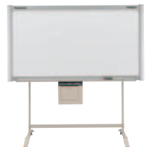
UB-5825 2-Screen Wide size